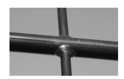
360° welded elements and black powder coating provide maximum durability