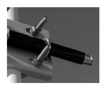
End fed connector facilitates installation